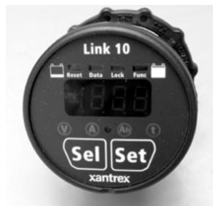
The Link 10 from Xantrex offers a lot of adjustability if you want to go beyond the basics.

Be sure to use twisted-pair wiring when called for. The vendors generally offered optional wiring