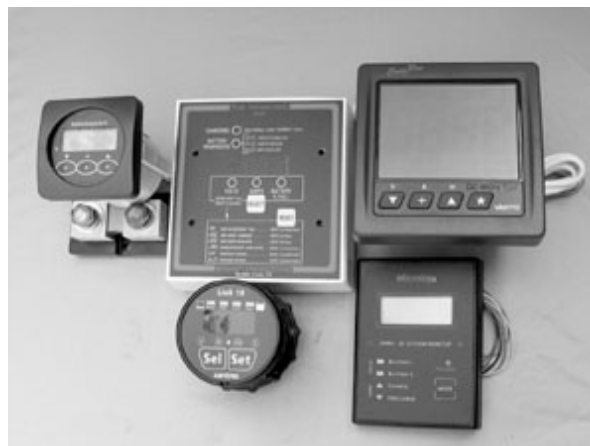
Top, left to right: The CruzPro VAH-30, the Trimetric 2020, the CruzPro VAH110. Bottom: the Link 10 and the Microlog.

The reason for all this fancy digital paraphernalia is quite sensible—simply measuring the voltage of a battery in use is nearly worthless for giving you the amount of charge left in a battery or bank of batteries. Such a measurement is only accurate on a battery that's been resting with no load for quite a while—30 minutes for a rough read and an hour for real accuracy. It takes that long for the battery chemistry to stabilize.