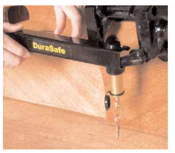
Quick and easy, the Durasafe slips over the outboard toggle clamps.

Removing both the Durasafe and Masterlock models was easy with just a couple of snips of the bolt cutters. A longer metal portion at the cover the problem.